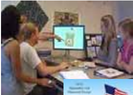
Students designing CFCC's 911 Memorial