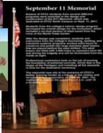
Completed 911 Memorial