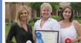
2008 Winners sweep the competition