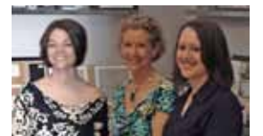
2011 Winners with instructor, center