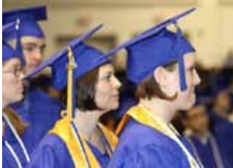
Students honored at graduation.