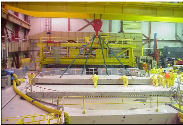
Removing shield blocks on refueling floor of reactor building