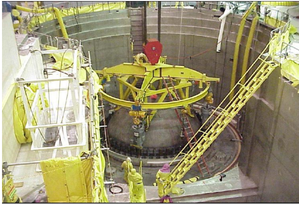
Detensioning reactor vessel head bolts